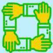
WORKING GROUP FORMATION

Ekopesantren program is conducted through assessment and recognition towards the Islamic schools that have put their best efforts to create such environmentally friendly educational environment through 10 ekopesantren program as follows.