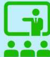
TRAINING AND COUNSELLING