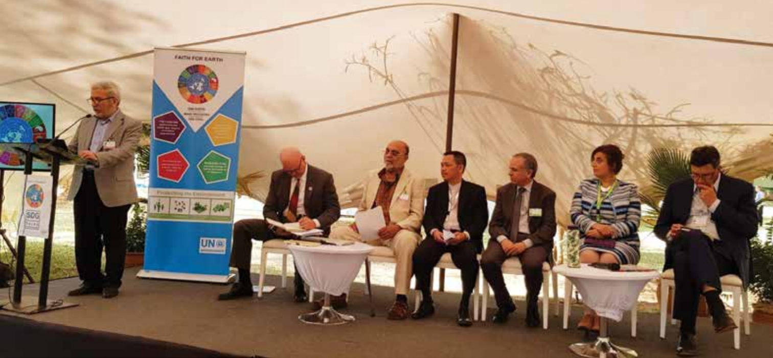
UNEP Faith for Earth side event regarding Islamic role in the protection of environment, facilitated by ICESCO of Morocco, held in Nairobi at UNEP headquarter.