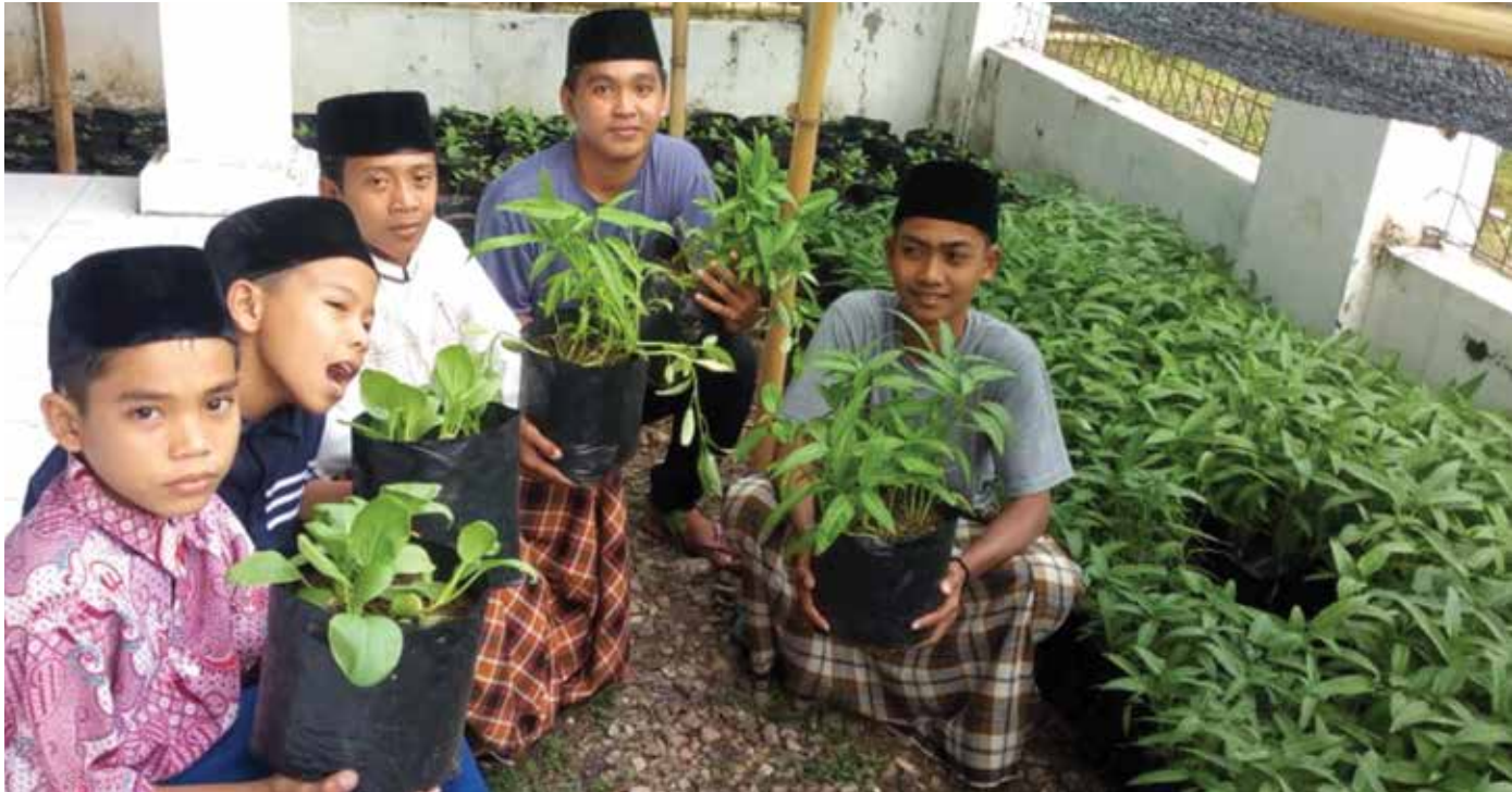
Students of Pesantren Darul Afkar in Banten learn how to grow plants at their pesantren garden.