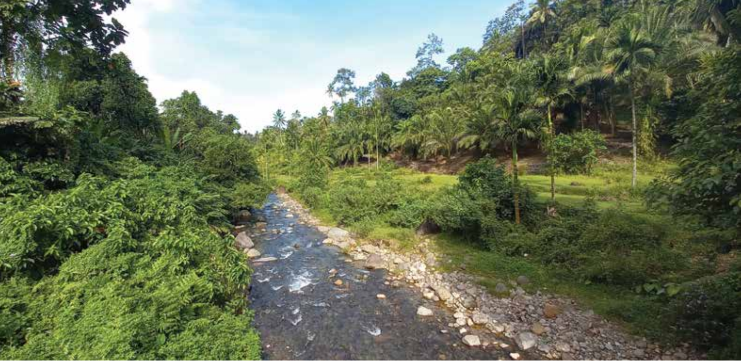
Lubuk Larangan (protected river) - PPI Unas research and mapping of more than 1000 spots of protected river in West Sumatra, North Sumatra, Jambi and Riau.

and crops even during war times as long as their existence remains advantageous to the enemy. Prophet Muhammad also calls for sustainable cultivation of land, waste minimization, humane treatment of animals, and protection of wildlife. Among the popular hadiths (Prophet Muhammad sayings) are: