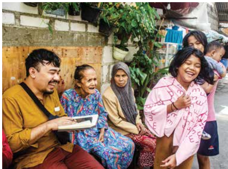
PPI Unas conducted a research in partnership with International Centre for Diarrhea Diseases Research Bangladesh to study the impact of Covid 19 to the disabilities as a part of the Hygiene Behavior Change Coalition (HBCC).

The purpose of this study is to evaluate the inclusiveness, effectiveness, and results of HBCC program interventions designed to prevent the