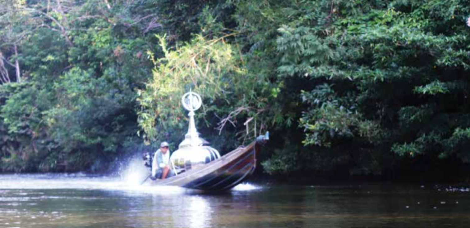
A man carrying a dome for their mosque at the village of Rimbang Baling Wildlife Sanctuary. Pious Muslim could contribute to protect endangered species.