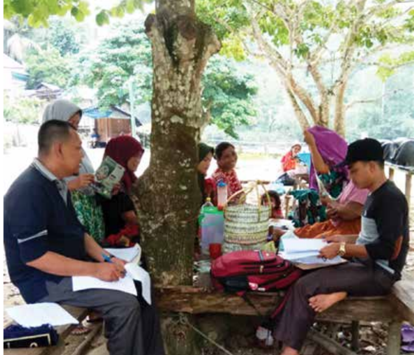
PPI -Unas conducted monitoring and evaluation for wildlife fatwa dissemination for the community in Rimbang Baling Wildlife Sanctuary, Riau.

In 2014, the Indonesian Ulema Council (MUI) issued the Fatwa No. 4/2014 on the Rare Animal conservation to protect the ecosystem