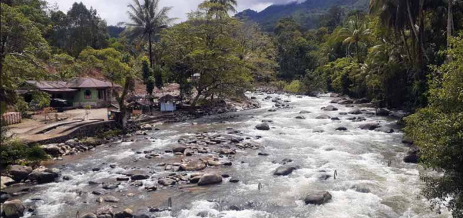
Lubuk Larangan Muara Soma, at the border of Batang Gadis National Park, North Sumatra.

for the protection of the Javan rhinoceros and its habitat. Under this project we seek to raise awareness and understanding of the national Islamic edict that calls on every Muslim to protect threatened species, to complement the current enforcement and species conservation initiatives at TNUK.