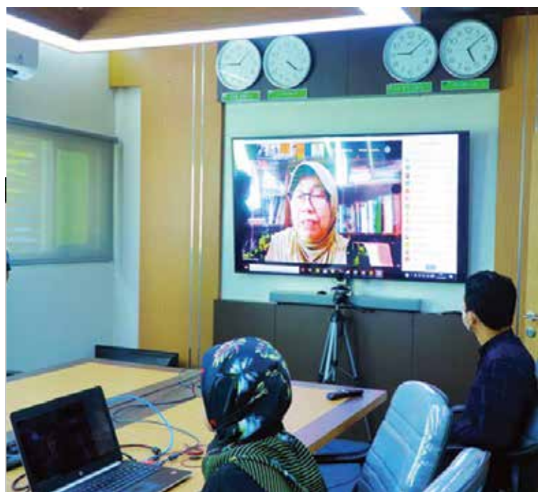
Participatory Workshop on HBCC (Hygiene Behavior Change Coalition) Project Evaluation Study in Indonesia organized by PPI Unas.

The program aims to raise clean hand behavior awareness. The PPI-Unass held a workshop on the HBCC on April 15, 2021. The workshop,