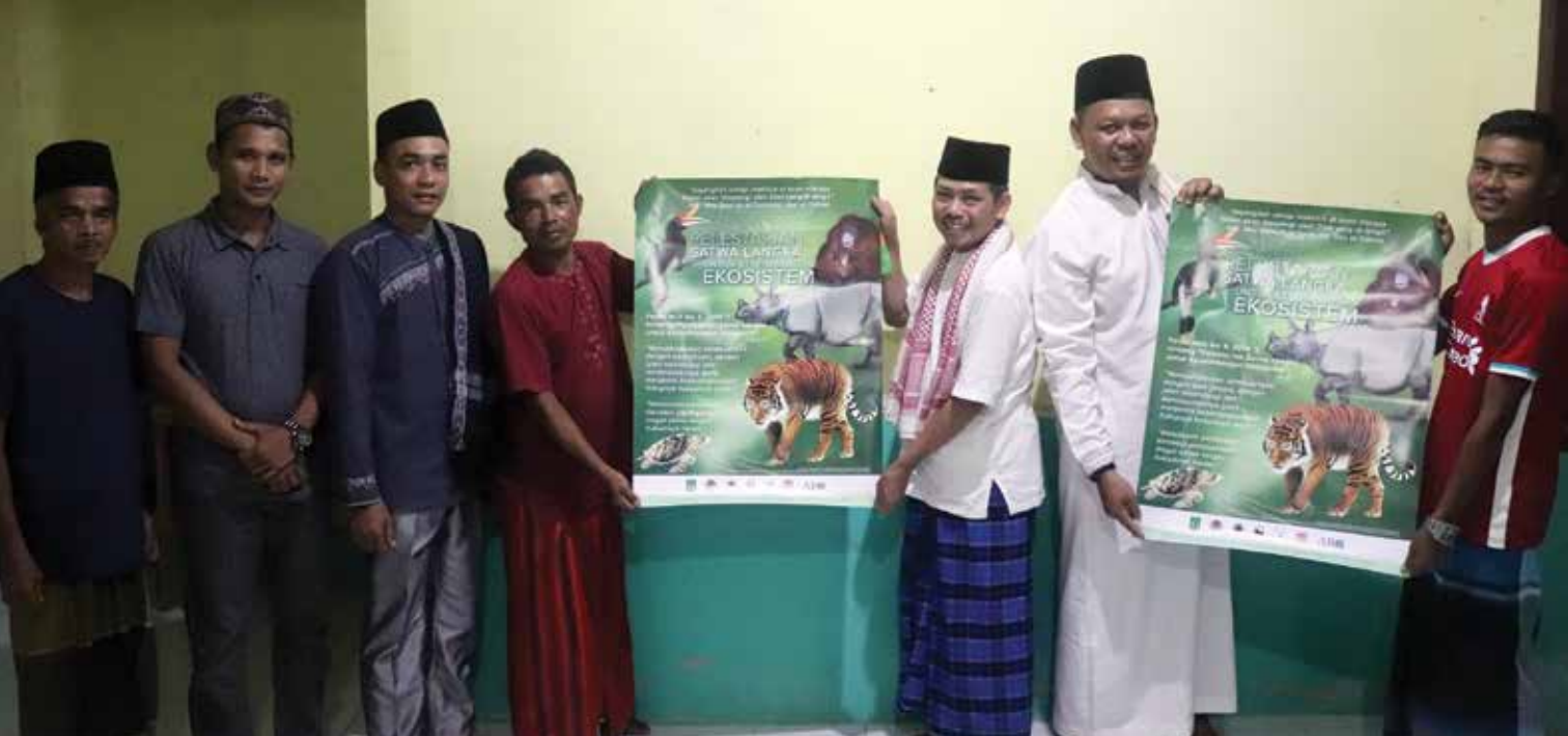
Dissemination of fatwa information to the grass root level by posting proster for village leaders in Rimbang Baling Wildlife Sanctuary, Riau.