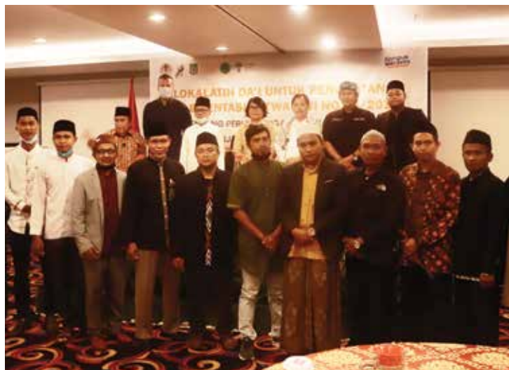
Imam capacity building for Islamic Ethic for conservation and environment in Pontianak, West Kalimantan.

The PPI-UNAS works with local religious partners to highlight teachings in the traditions of those who speak out to care for the planet and